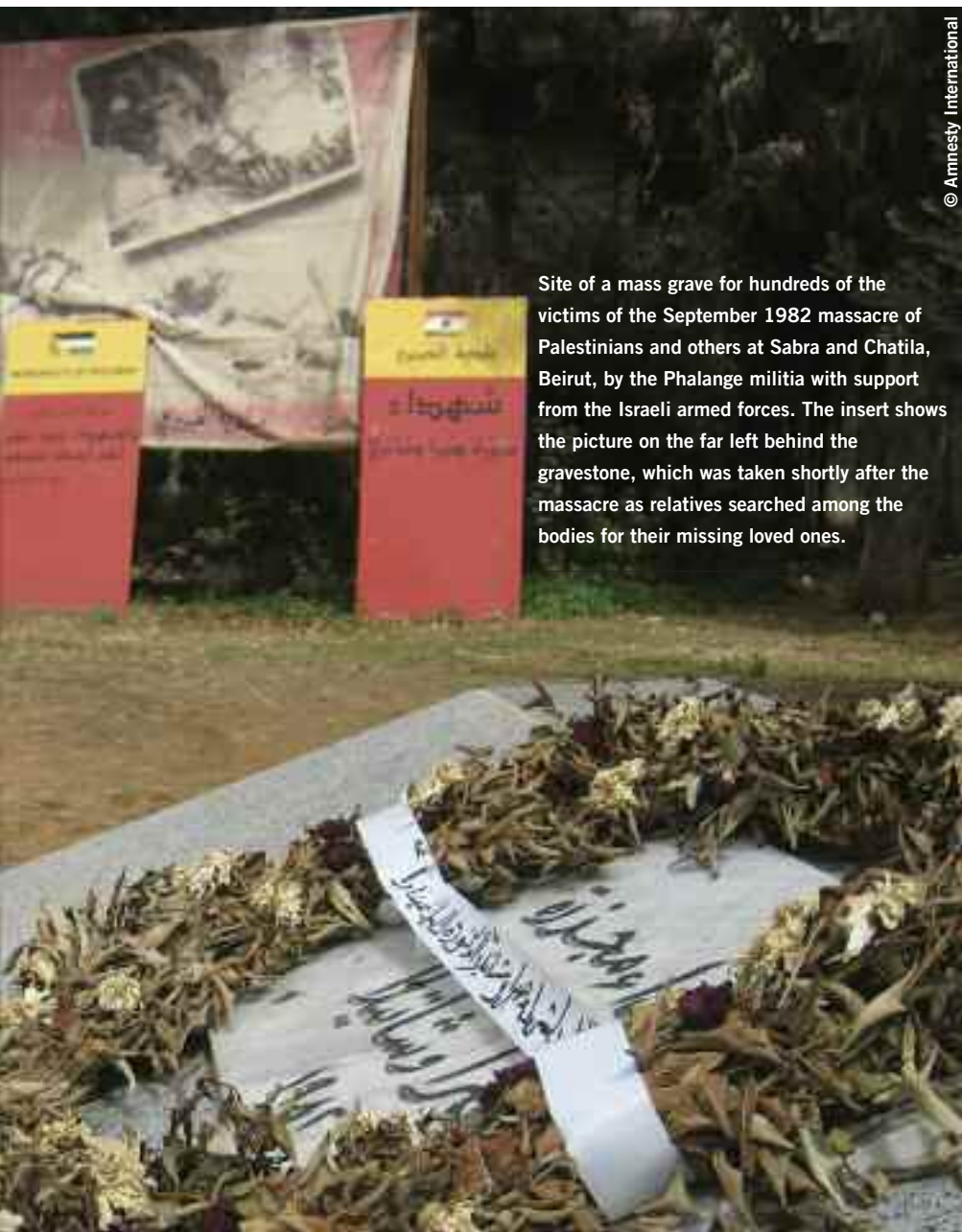
Site of a mass grave for hundreds of the victims of the September 1982 massacre of Palestinians and others at Sabra and Chatila, Beirut, by the Phalange militia with support from the Israeli armed forces. The insert shows the picture on the far left behind the gravestone, which was taken shortly after the massacre as relatives searched among the bodies for their missing loved ones.